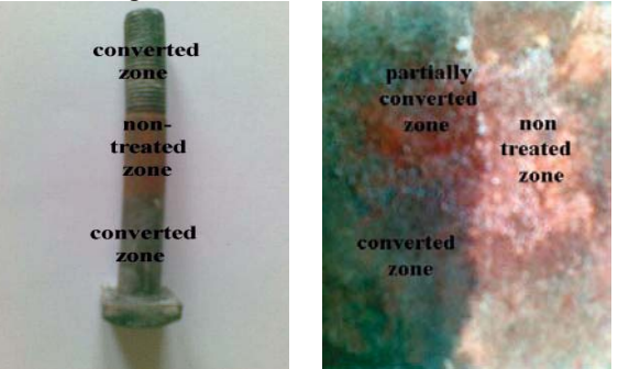
Fig. 4. Images of rusted stud (left) and iron plate (right) after treatment with LR-3.

Additionally, selected areas with different extent of rust converting are presented in Figure 3. Fig. 3A (left) demonstrates when the conversion process has been partially applied. The black zones are these places where almost the whole rust is converted, ensuring an improved corrosion resistance. White areas are the places where the process is not fully completed and where rusted and converted sections exist at the same time. Figure 3B shows a zone where the converting process is almost complete.