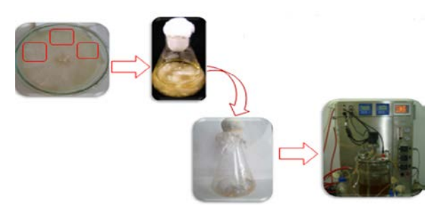
Fig. 2. Schematic presentation of biological pretreatment of wheat straw and introduction into the bioreactor.

Among the biological methods for pretreatment, the use of wood degrading fungi is one of the most effective and widely applied methods (Fig. 2). The hyphae of the fungi can secrete many ligninolytic enzymes which catalyze oxidative reactions during lignin depolymerization [13]. The peroxidases produced by them weaken and/or destroy the bonds linking cellulose and lignin.