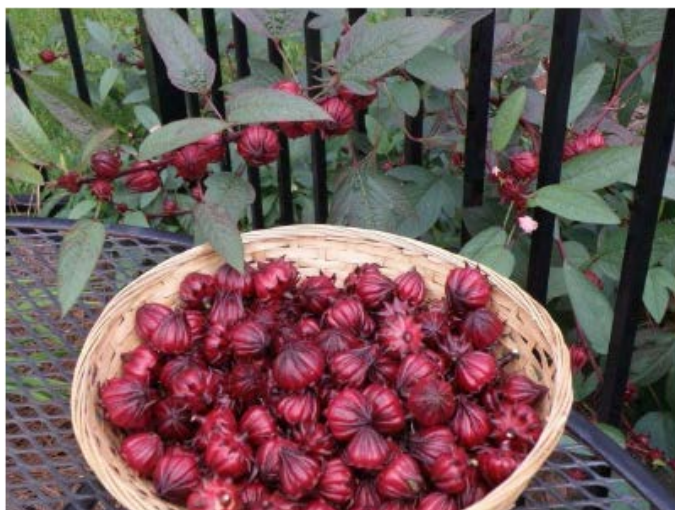
Figs. 1. Roselle flowering branch

All known compounds were identified by comparison of their melting points and spectral data with those reported in the literature. Melting points were determined with an electrothermal 9100 apparatus and are uncorrected. IR spectra were determined as KBr discs on a Shimadzu IR-460 spectrophotometer. NMR spectra were obtained on a Bruker Avance DRX-300 MHz spectrometer ( ^1\text{H} NMR at 400 MHz, ^{13}\text{C} NMR at 100 MHz) in \text{DMSO}-d_6 using TMS as internal standard. Progress of the reactions was monitored by TLC using silica gel SIL G/UV 254 plates. Microwave reactions were carried out in a microwave oven (2500 W power; Micro-Synth, Milestone).