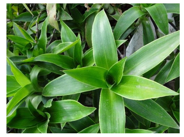
Fig. 1. C. fragrans

According to the results of our experiments, in hydroponic conditions the plants were distinguished with high productivity of medicinal raw material. Due to the high yield of biomass, the output of bioactive substances from the medicinal raw material of hydroponic plants was also higher compared with the output from the soil plants. Moreover, the experiments also showed that hydroponic conditions had positive impact on the physiological activity of the leaves and the content of photosynthetic pigments in the leaves [6-8]. According to the literature review, the intensity of photosynthesis in plants is largely due to the presence of AsA (vitamin C), which is considered to be a cofactor of enzymes which are involved in the regulation of photosynthesis [9].