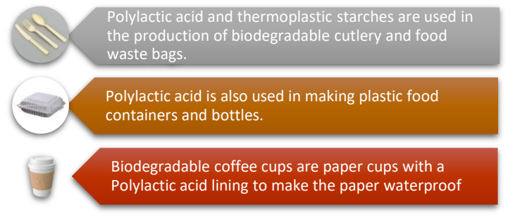
Figure 3. Applications of polylactic acid in food industry [53].

Some applications of polylactic acid in food industry are shown in Figure 3.