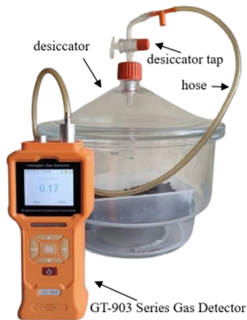
Fig. 1. Measurement system.

Powder diffraction analyses were used to verify the purity of reagents and the resulting products. The powder diffraction patterns were obtained by X-ray diffractometer “D2 Phaser”, Cu-K \alpha radiation