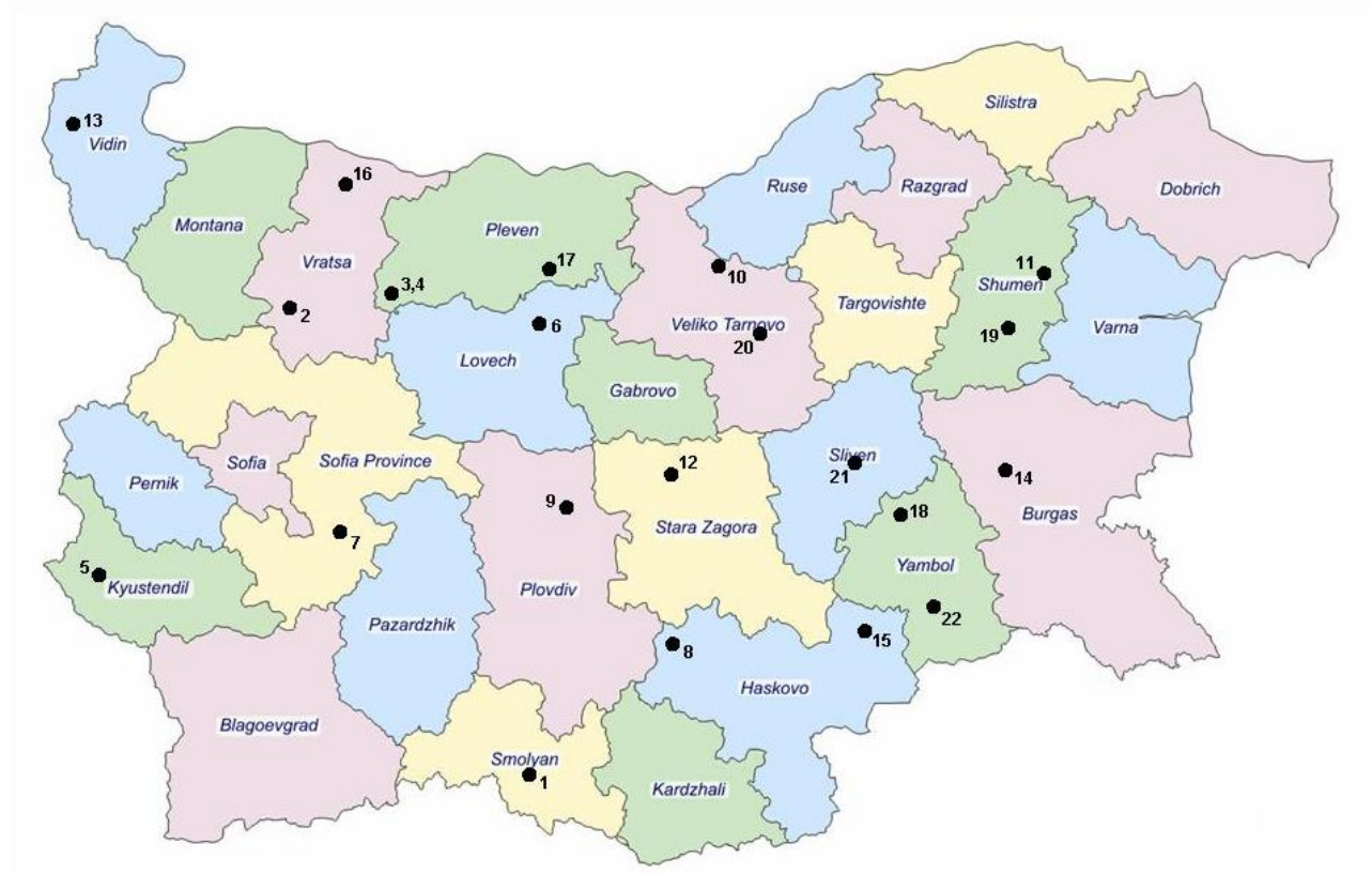
Fig. 1. Locations where propolis samples were collected in Bulgaria (\bullet) .

the amount of balsam, the extract of crude propolis in 70% ethanol was determined, this being the most