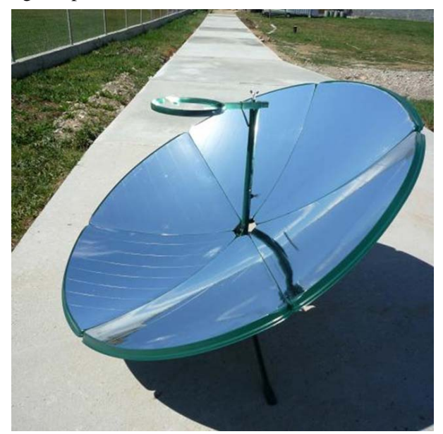
Fig. 1. Solar parabolic cooker.

The reflector has the form of a paraboloid and is covered with reflective foil, the purpose of which is to reflect the solar radiation falling on it with the highest possible reflection coefficient.