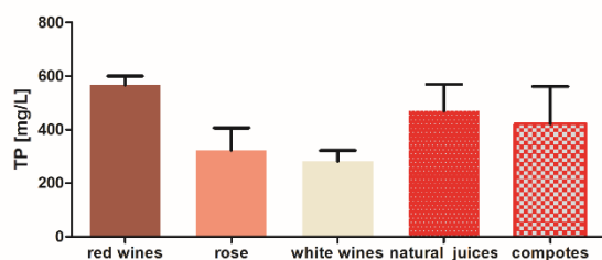
Fig. 1. Total phenolic content of wines, natural fruit juices and compotes from the Bulgarian market. TP – total phenolics

Total polyphenolic content, anthocyanin concentration and antioxidant activity of the tested drinks are presented in Figs. 1 and 2.