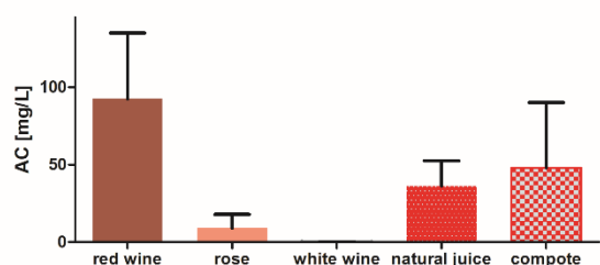
Fig. 2. Total monomeric anthocyanin content of wines, natural fruit juices and compotes from the Bulgarian market. AC – total monomeric anthocyanins

The highest polyphenolic content was established for the red wines, followed by natural fruit juices, compotes, rosé wines, and white wines. Among the tested alcoholic drinks the red wines revealed significantly higher average polyphenolic content (567 ± 32 mg/L) vs rosé (323 ± 84 mg/L, p < 0.0001 ) and white wines (281 ± 42 mg/L, p < 0.0001 ). The natural fruit juices and compotes revealed similar polyphenolic content 470 ± 99 mg/L vs 421 ± 139 mg/L, respectively (Fig. 1).