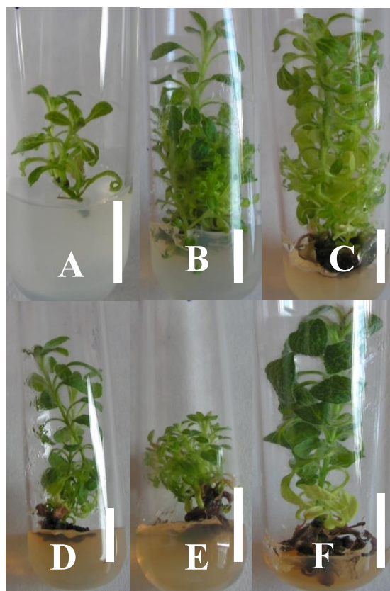
Figure 1. Development of Sideritis scardica Griseb. shoot cultures in Rm (A), Sm (B), Sr_1 (C), Sr_2 (D), Sr_3 (E) and Sr_4 (F) culture media.

In addition to increasing of number of axillary shoots formed, the study showed that with the exception of the Sr_3 treatment (Fig. 1E, 0.5 \text{mg.L}^{-1} BA and 0.5 \text{mg.L}^{-1} NAA), PGR significantly increased the length of obtained plantlets. The leaves of the PGR modifications Sr_2 (0.2 \text{mg.L}^{-1} BA and \text{mg.L}^{-1} NAA) and Sr_4 (0.5 \text{mg.L}^{-1} BA and 1.0 \text{mg.L}^{-1} NAA) were visually characterized by larger leaf area, as compared with the other treatments (Figs. 1D and 1F).