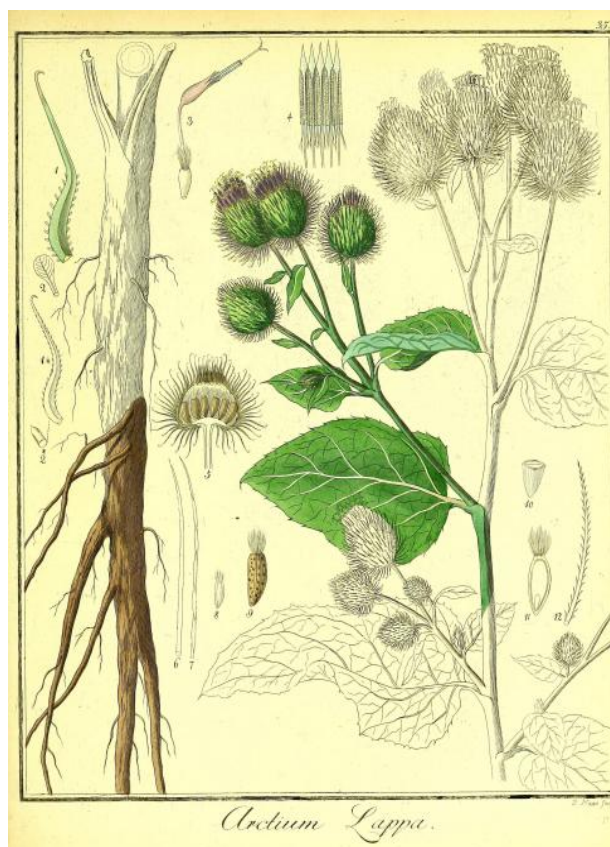
Fig. 1. Arctium lappa [18]

The aim of the present study is to examine the capabilities of mild and green techniques that apply a supercritical solvent without and with co-solvents to obtain high value compounds from the different parts of the burdock plant, which nowadays is treated as a waste, with the view of its complete valorization and in accordance to the principles of the circular economy.