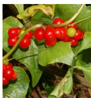
Tamus communis L.